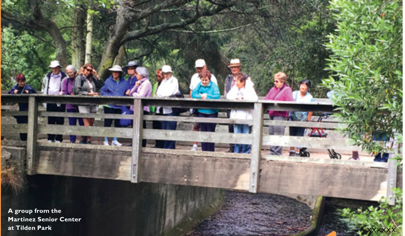
A group from the Martinez Senior Center at Tilden Park