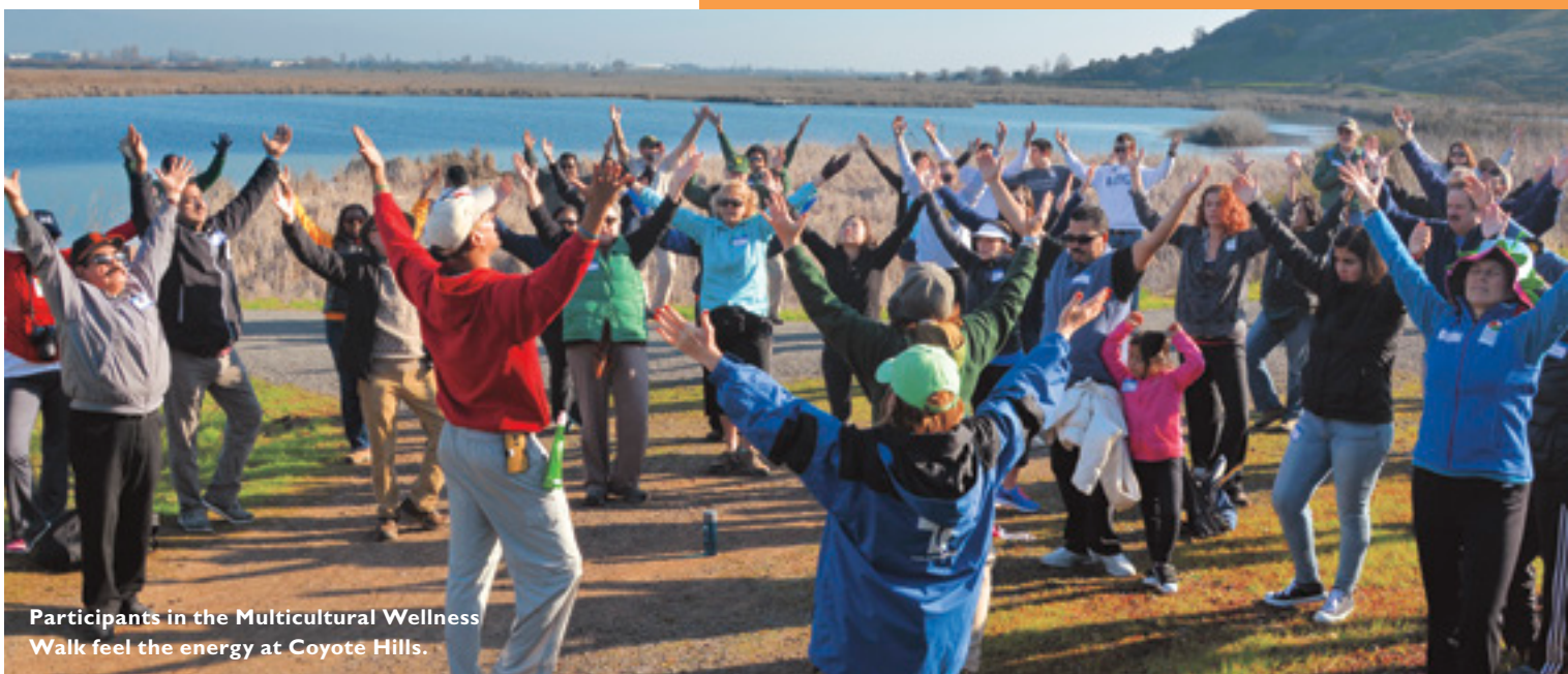
Participants in the Multicultural Wellness Walk feel the energy at Coyote Hills.