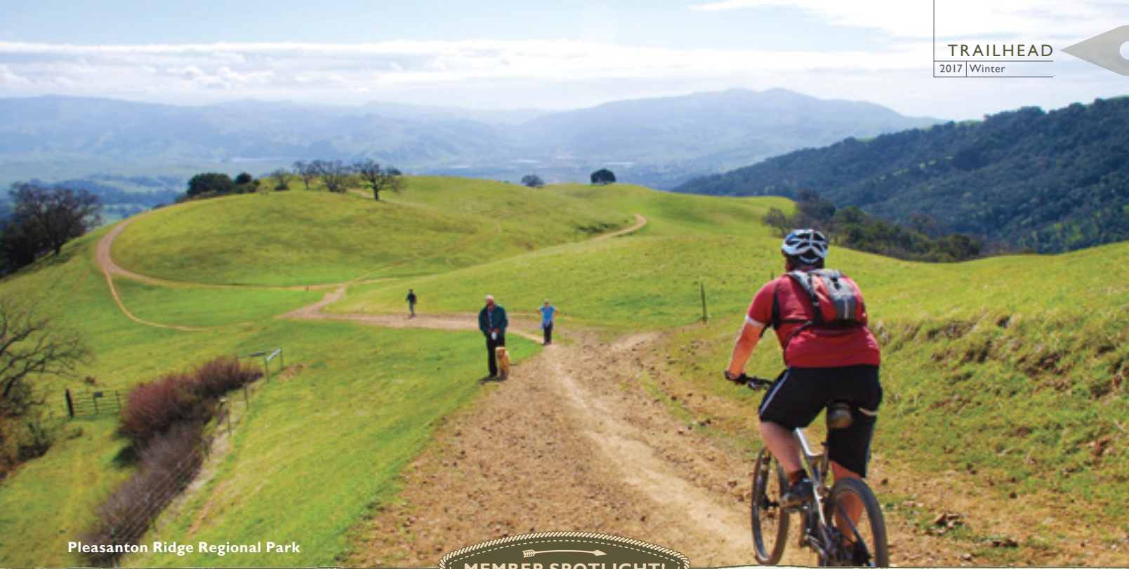
Pleasanton Ridge Regional Park