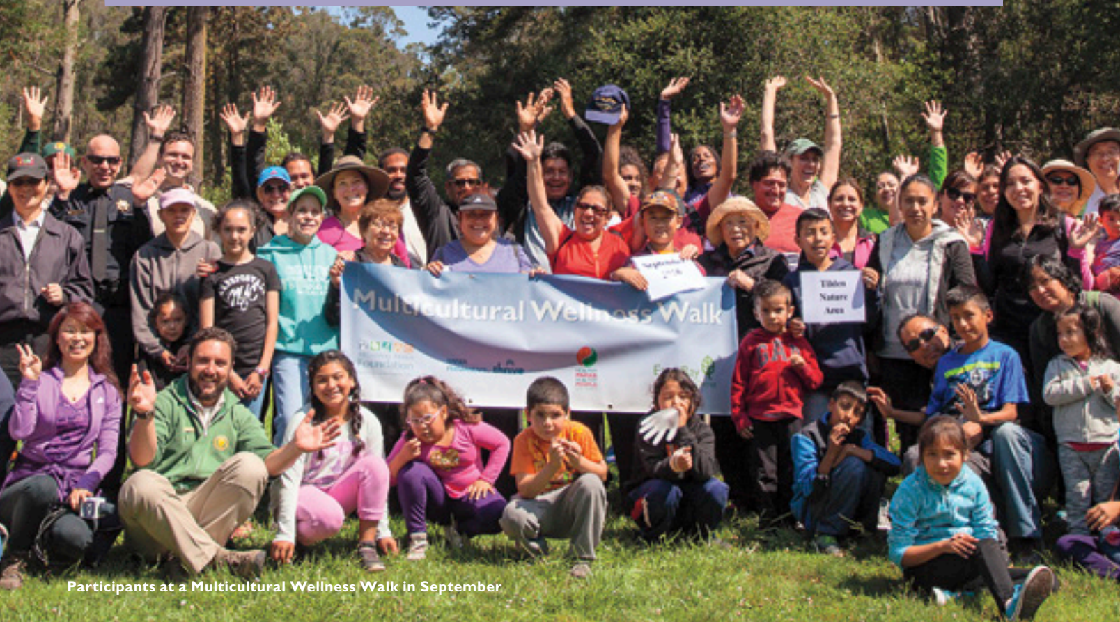
Participants at a Multicultural Wellness Walk in September

With the generous support of Kaiser Permanente and the Regional Parks Foundation, the Multicultural Wellness Walk is just one of many innovative ways that EBRPD reaches out to different communities and demographics. Read on to learn how EBRPD helps to make lasting connections between people and nature—and between people and people.